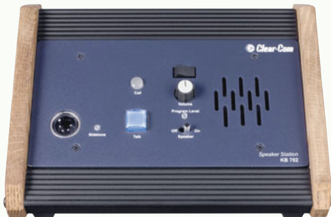
KB-702 in a V-Box